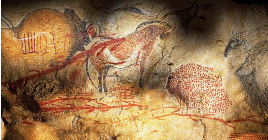
Various layered cave drawings – possibly showing a map.