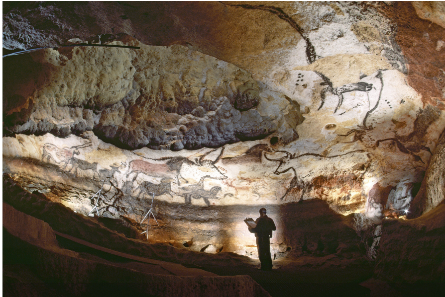
Cave in France.